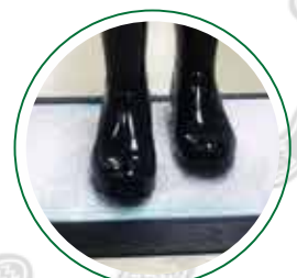
Sponge with polyurethane base